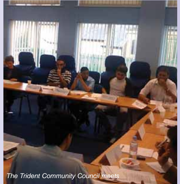
The Trident Community Council meets

I will work to keep up standards to make the area an even better place to live in.