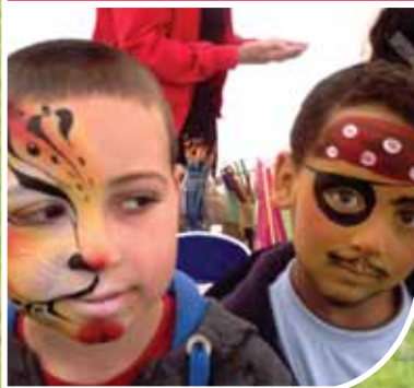
Cover photo by Rais Hasan