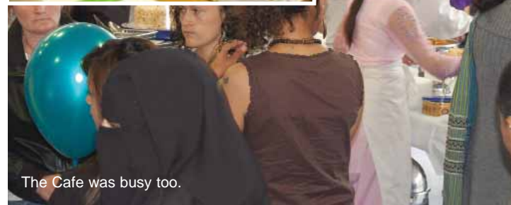
The Cafe was busy too.