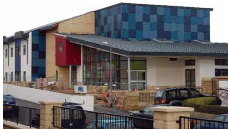
Park Lane Centre