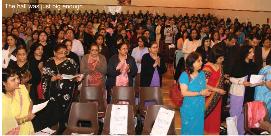
The hall was just big enough.

All delegates were treated to a healthy vegetarian Indian meal which encompassed key areas of the healthy eat well plate. The conference was supported by the British Heart Foundation, Diabetics UK, the Food Standards Agency, Natural England and the NHS, who supplied their publications for the conference packs. Lloyds Pharmacy supplied Body Mass Index Calculators and Bradford Metropolitan Council stepped in with free 'B-Active' pedometers.