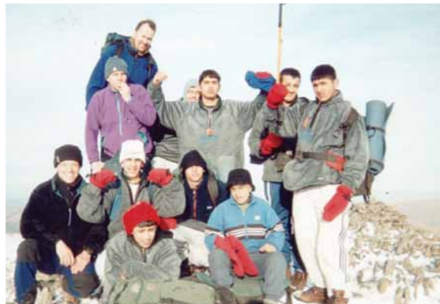
West Bowling Youth Initiative promotes all sorts of activities such as this Outward Bound trip.

Project Part-Financed by the European Union European Regional Development Fund