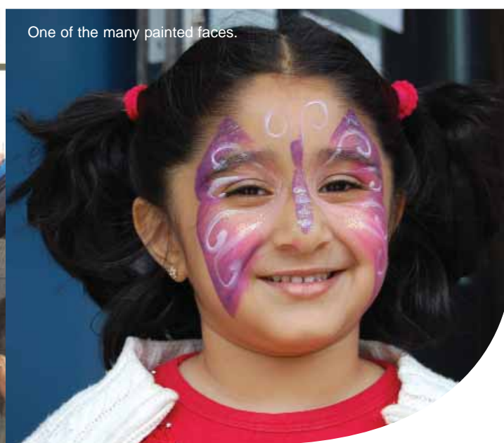
One of the many painted faces.