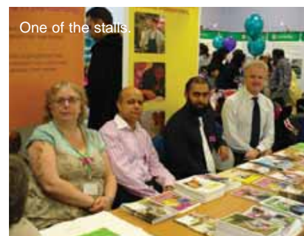
One of the stalls.