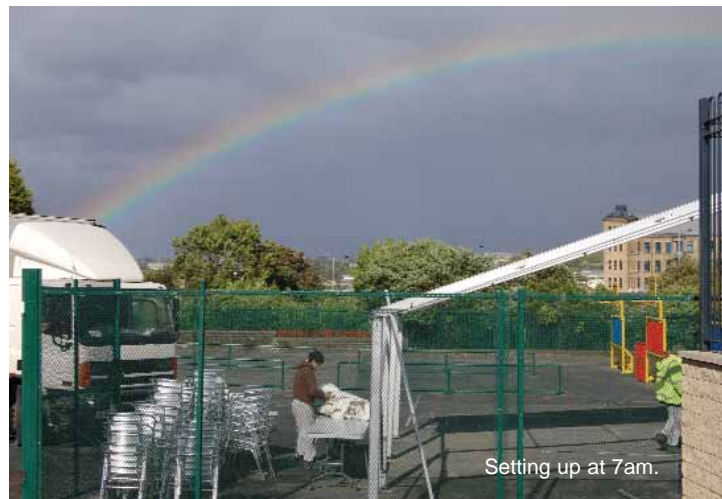
Setting up at 7am.

Despite record breaking high winds the Annual Bradford Trident Summer Celebration proved as popular as ever. This year the event doubled up as the Official Opening of the new Park Lane Centre. As our photos show a good time was had by all!