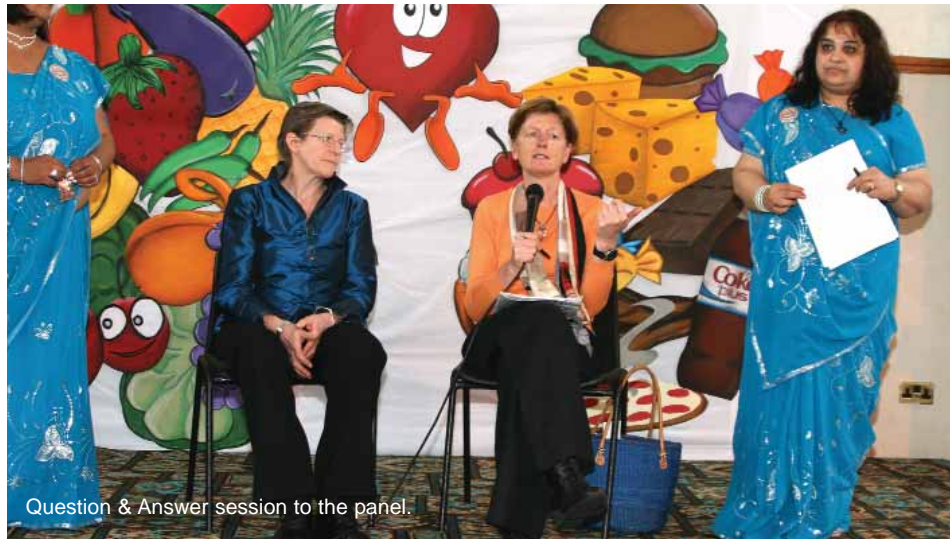
Question & Answer session to the panel.