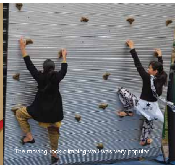
The moving rock climbing wall was very popular.